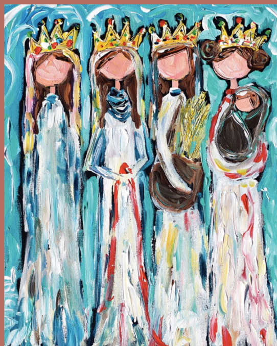
"The Women in the Genealogy of Jesus"